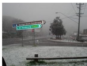
Winter 2008 is treating guests to snow in the Dandenong's!